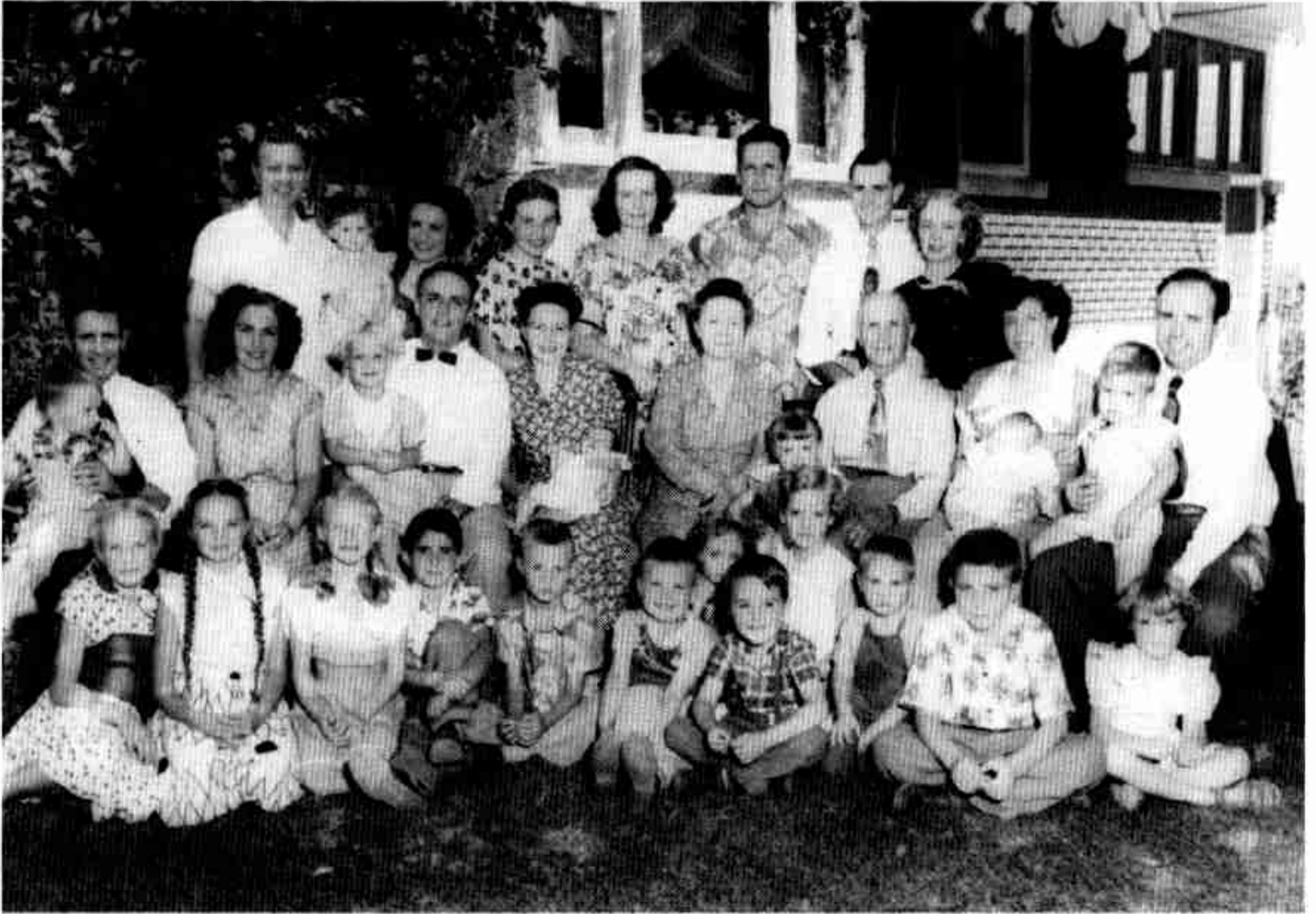
The family gathered at Benson, Utah in 1952